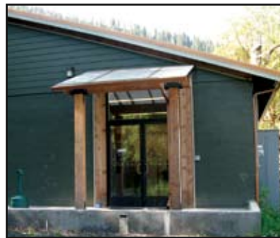
Happy Camp TANF entrance on the corner of Third and East Avenue in Happy Camp (behind the old Headway Market)

TANF Program Fiscal Technician Cecilia Arwood