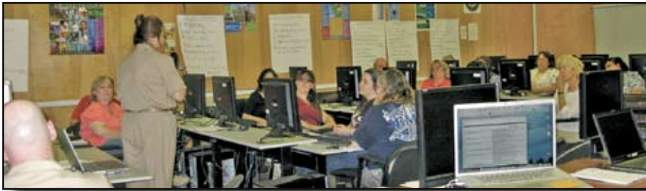
IHS training Karuk Tribe medical staff on the new Electronic Health Record (EHR) system at the Happy Camp Computer Center

Sacramento. Each clinic has a handout for patients which explains EHR and how it works, and we invite you to drop in and see how this technology will enhance and improve our ability to serve our patients throughout our three clinics.