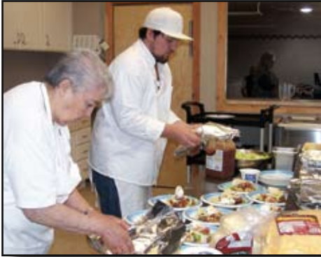
Making home-bound meals in Happy Camp

are after hours activities that include the Community Service Club's monthly meetings, the 'by the river