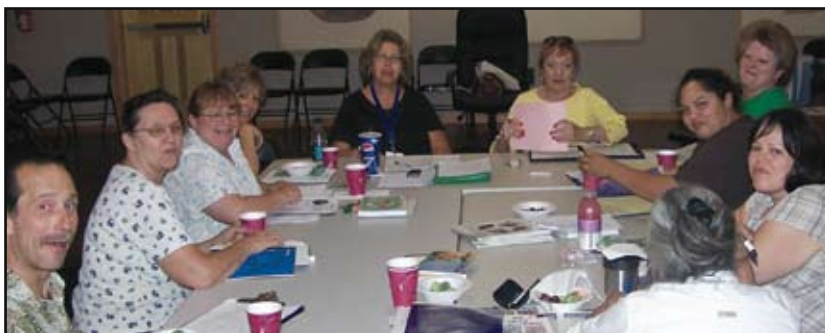
Caregiver Class in Happy Camp

The emphasis at our national meeting is to celebrate what you have in your community that is open to all people. Share resources; invite other organizations to provide services and activities for the seniors in your community. Join in on activities that are already in your community. One organization can not afford to do everything in these times of economic hardships. Have youth programs working for elders. Get volunteers to have activities. Start a community garden. Celebrate!